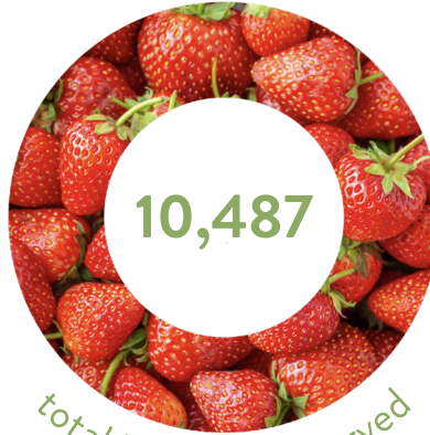
total households served