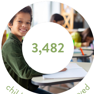
children under 18 served