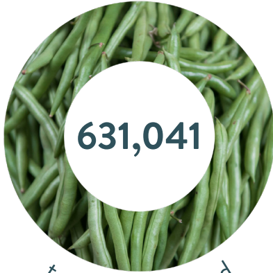
total meals served