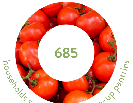
households served across 9 pop-up pantries