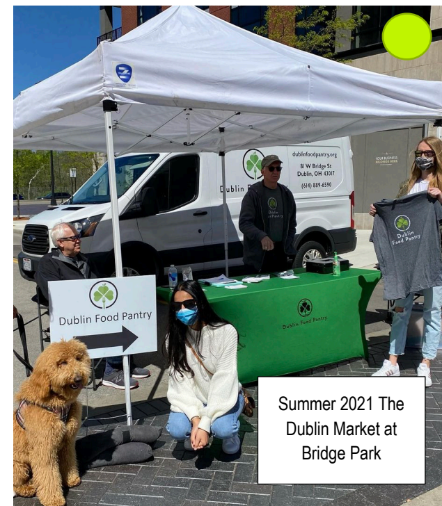
Summer 2021 The Dublin Market at Bridge Park

Although our traditional events were cancelled in 2021, new outdoor opportunities allowed us to connect in-person. Our volunteers work at Dublin Food Pantry's event locations in addition to helping at the pantry sorting, packing, and distributing food and essentials. No wonder we think they are awesome!